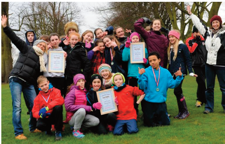
Newark Athletics Club Newsletter: March 2015